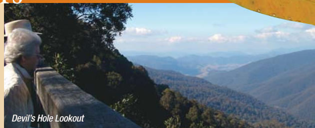
Devil's Hole Lookout

Scone (or Aberdeen) – Gundy – Belltrees – Moonan Flat – Barrington Tops Circuit – Moonan Flat - Belltrees – Scone (or Aberdeen)