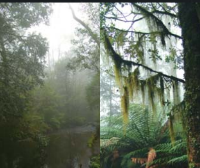
Dilgry River hidden Banksia Picnic area