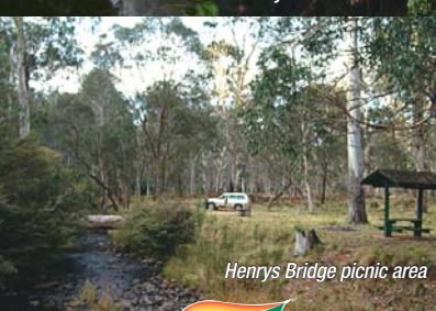
Henry's Bridge picnic area

km Scone Turn off the New England Highway at the southern end of town onto Gundy Road.