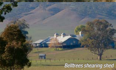
Belltrees shearing shed