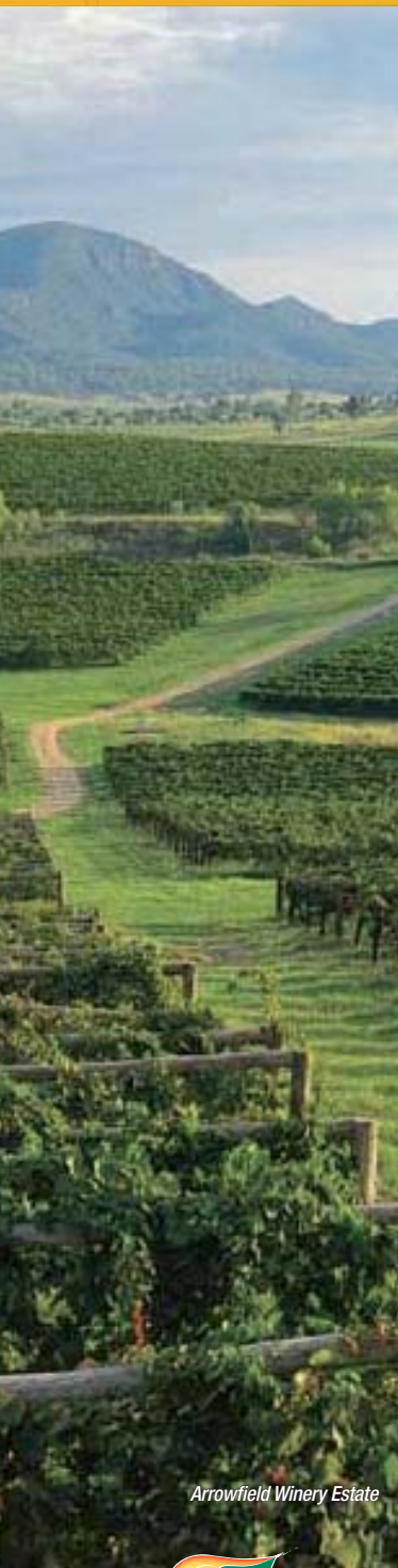
Arrowfield Winery Estate

150 Muswellbrook Turn left along New England Highway to visit the Hunter Bell Cheese Factory and Tasting Room (p14) at the northern edge of Muswellbrook.