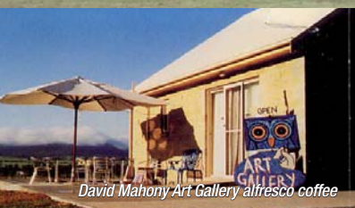
David Mahony Art Gallery alfresco coffee