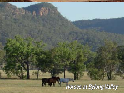
Horses at Bylong Valley