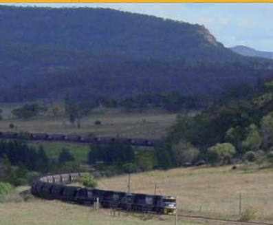
Train at Phipps Cutting